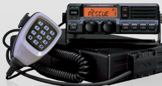
REMOTE MOUNT CONFIGURATION