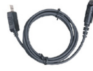
Programming Cable (USB Port) PC25