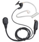
Earpiece w/on-MIC & PTT (Transparent Acoustic Tube) EAN04