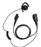
Earset Swivel EHN17