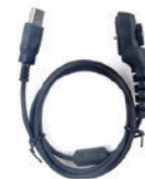
Programming Cable (USB Port) PC38