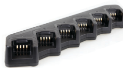
MCU Multi-Unit Charger (For Thick Battery) MCA08