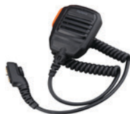
Remote Speaker Microphone (IP57) SM18N2